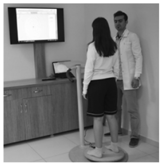
Figure 2. Assessing the postural stability level.

Table 1. Demographic and clinical characteristics of the patients (N=35).